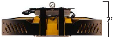
NEW 7" LOW PROFILE DESIGN